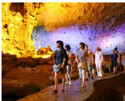
Thien Cung Cave

Halong – Hanoi: 165km => 4-hour transfer including break time on the way