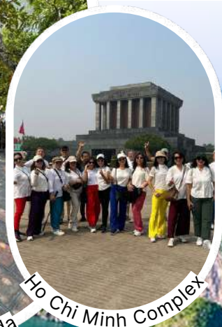
Ho Chi Minh Complex