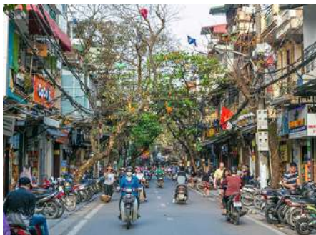
Hanoi Old Quarter