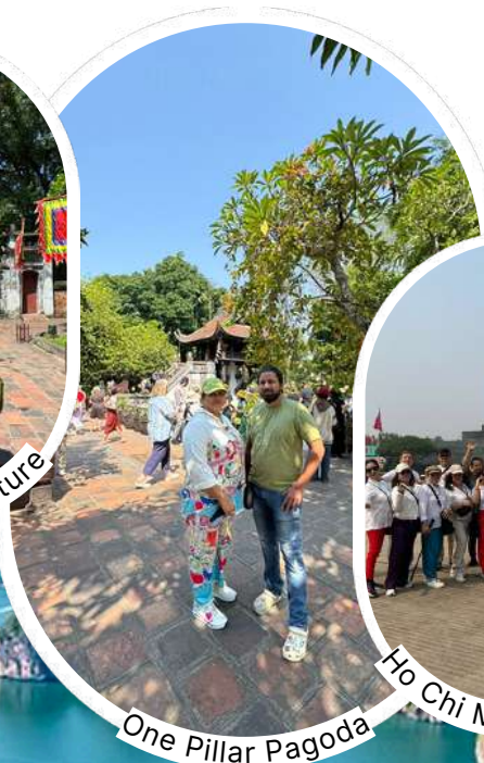
One Pillar Pagoda