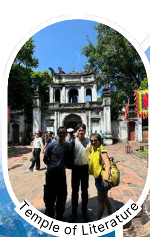
Temple of Literature

Note Ho Chi Minh Mausoleum is opened in the morning only and closed on Mondays, Fridays for maintenance. So, you will visit outside of Ho Chi Minh Mausoleum, Ba Dinh square, Presidential Palace, Ho Chi Minh's House on stilt, One pillar pagoda as normal